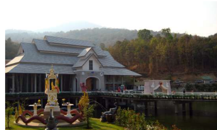
2007 | Chiang Mai Zoo Aquarium Chiang Mai, Thailand