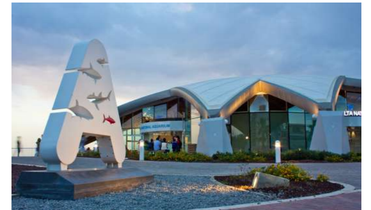
2013 | National Aquarium of Malta Malta