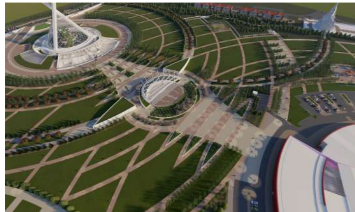
2018-2024 | Galactika Park Kogalym, Russia