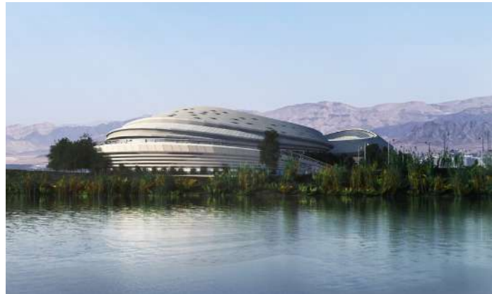
2023-2025 | Aqaba Aquarium and Marine Science Hub Aqaba, Jordan

Since 1973 Aquamarine has been involved in many major developments across the world. Pioneers in the field, we have conceptualised, designed, constructed and managed over a 1000 projects. Here is a summary of our most recent projects.