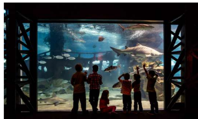
2011 | Greater Cleveland Aquarium Cleveland, U.S.A.