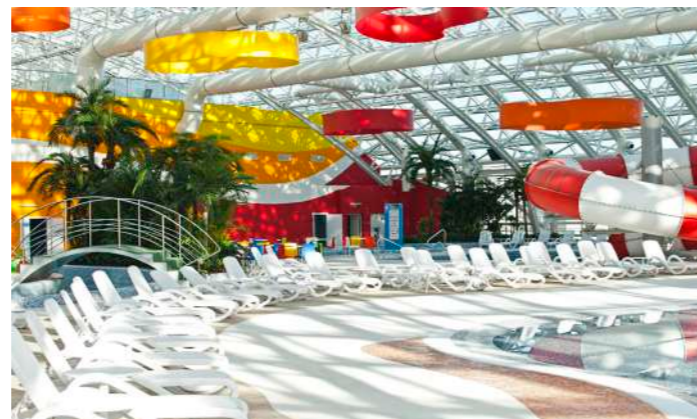
2013-2016 | Galactika Waterpark Kogalym, Russia