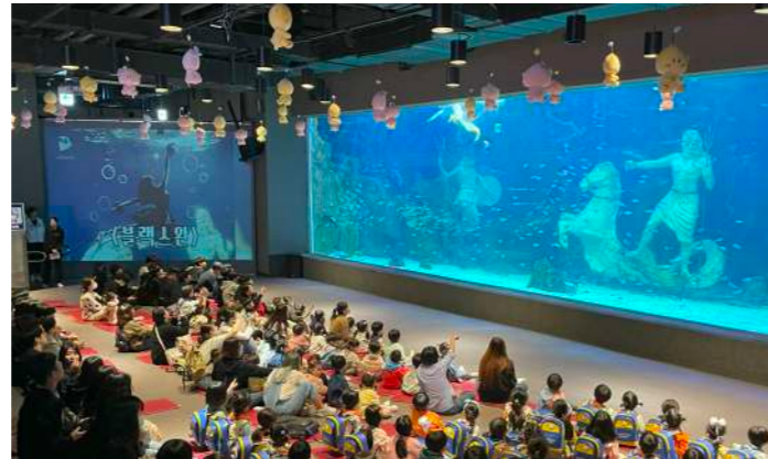
2022 | Daejeon Expo Aquarium Daejeon, South Korea