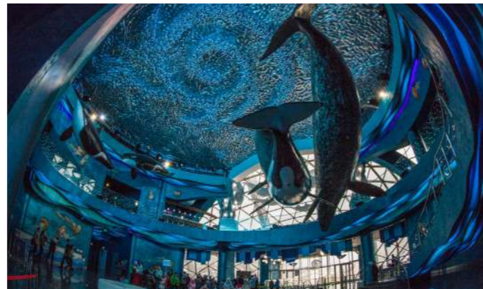
2006 | Primorsky Oceanarium Vladivostok, Russia