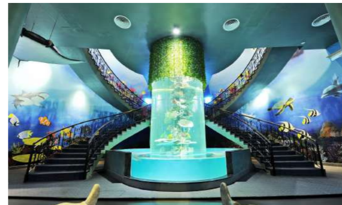
2007 | Vinpearl Aquarium Nga Trang, Vietnam