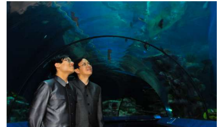
2012 | Sindok Aquarium Wonson, North Korea