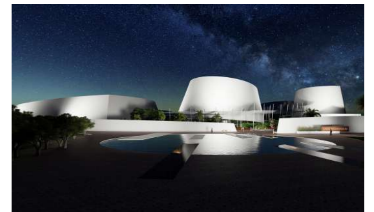
2020-2025 | Cadiz Oceanarium Cadiz, Spain