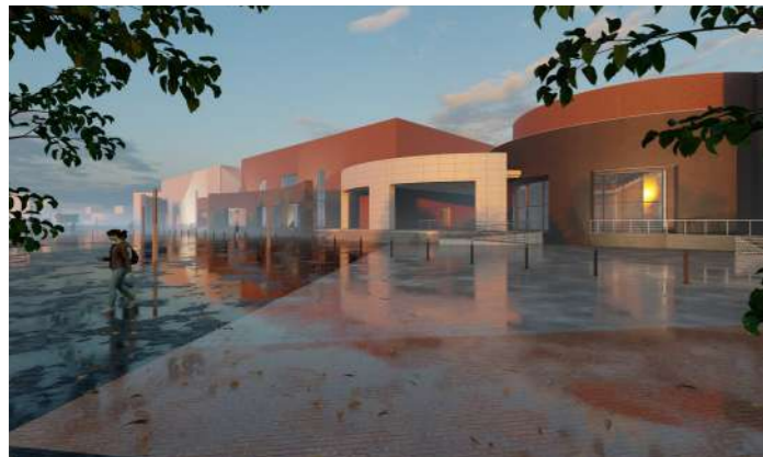
2022-2025 | Museum of Russia Kogalym, Russia