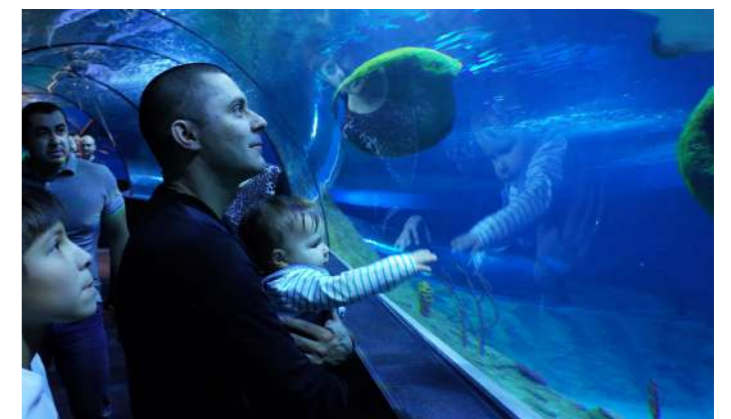
2016 | Galactika Aquarium Western Siberia, Russia