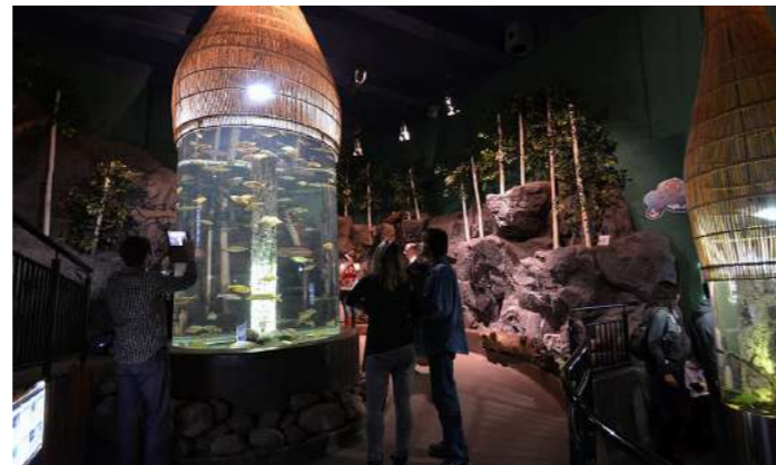
2006 | Neptune Aquarium St Petersburg, Russia