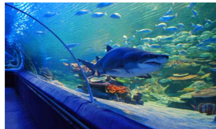
2009 | Turkauzoo Aquarium (Sealife Istanbul) Istanbul, Turkey