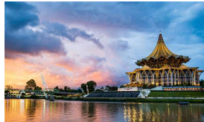
2024 | Mambong Tourism Masterplan Sarawak, Malaysia