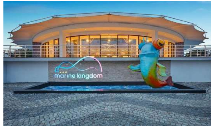
2018 | VGP Marine Kingdom Chennai, India