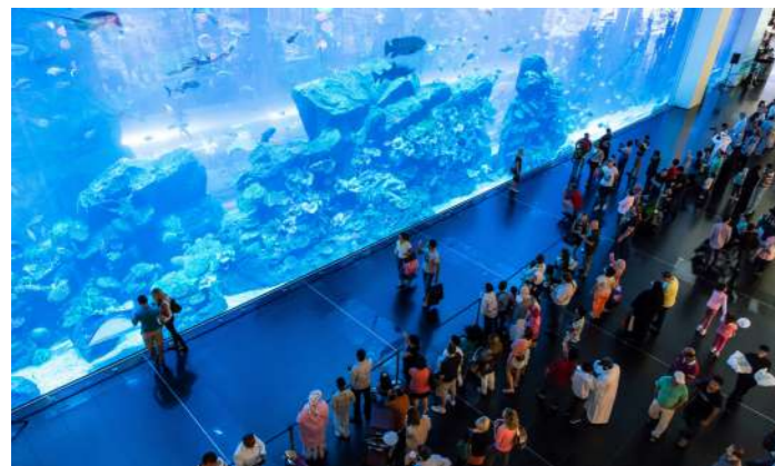
2013-2016 | Dubai Aquarium & Underwater Zoo Dubai, U.A.E.