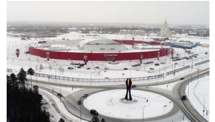
2013-2016 | Galactika Entertainment Center Kogalym, Russia