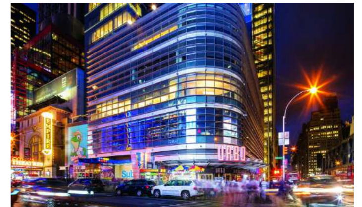
2012 | Eleven Times Square Aquarium New York, U.S.A.