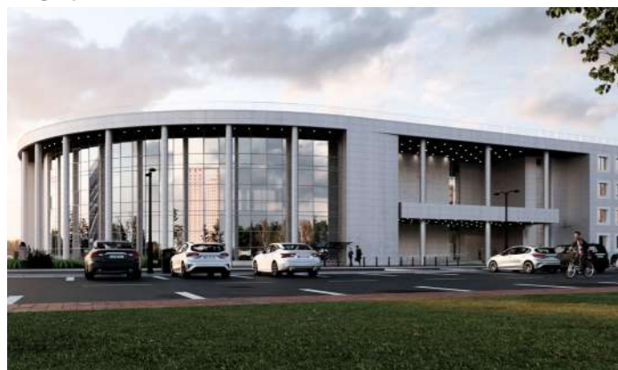
2023-2025 | NRG Residences Kogalym, Russia