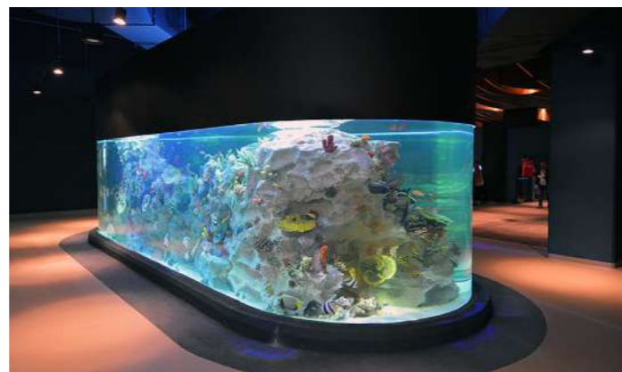
2014 | EMAAR Aquarium & Underwater Zoo Istanbul, Turkey