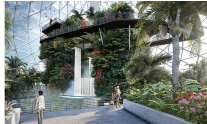
2018-2025 | Yaranga Botanical Garden Kogalym, Russia